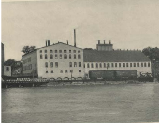
Kimberly, Clark and Company partnered with Minnesota investors to own the Atlas Mill in Appleton.